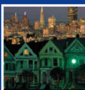
Administrative / Residential buildings